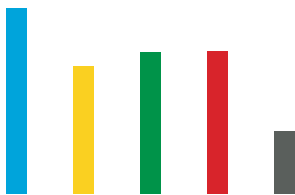
YEARS TO MATURITY (%)